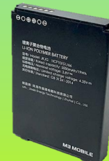
SL20-BATT-E50 SL20 Battery