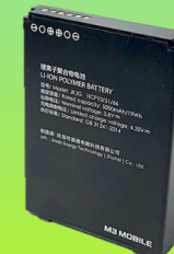
SL20-BATT-E50 SL20 Battery